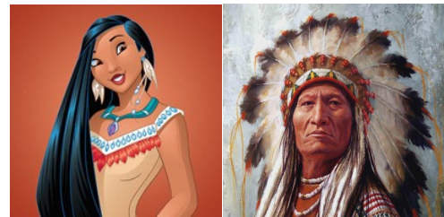
This term we will be learning about the Native Americans in History.